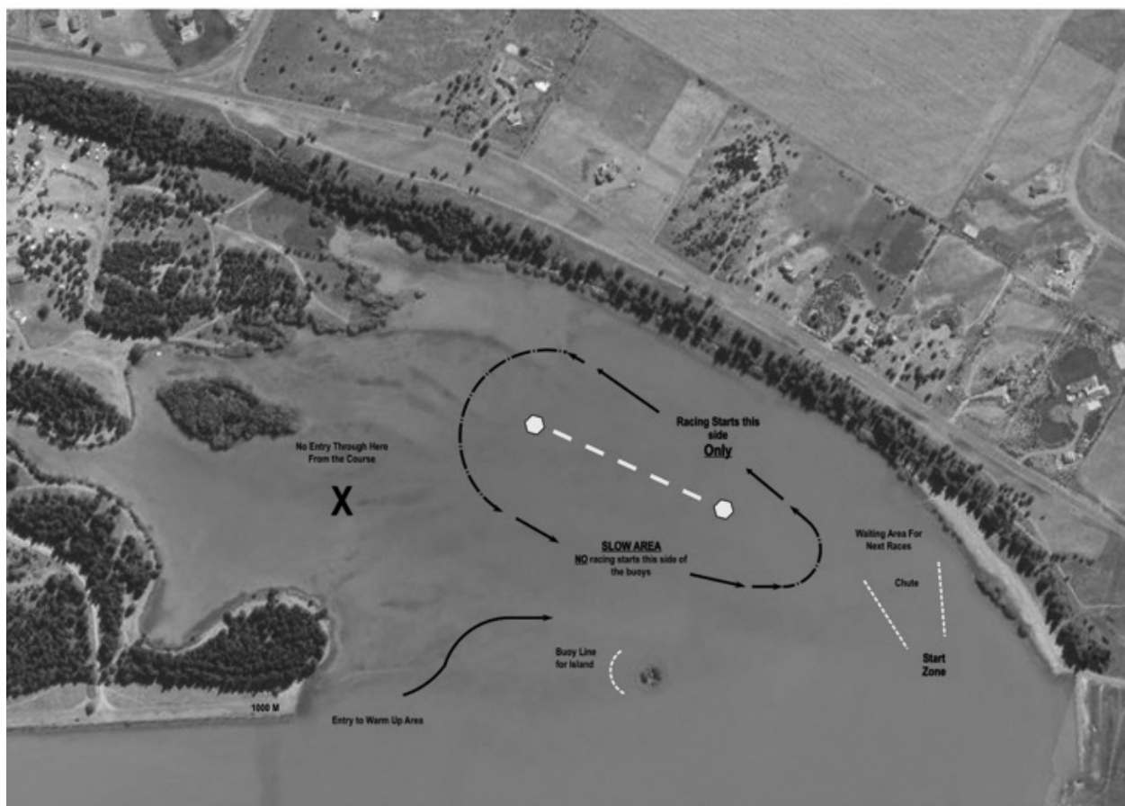
Traffic Plan for The Bay, Lake Ruataniwha